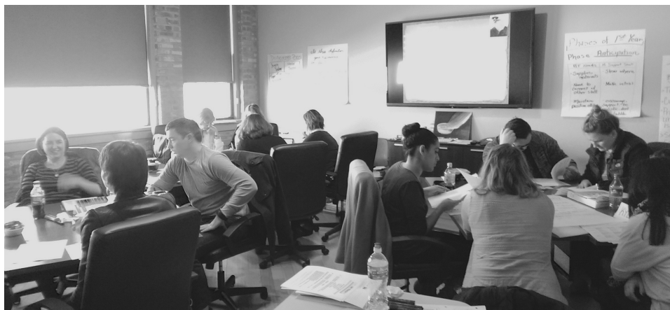
December 5, 2015 Professional Development @ CTEP: Strategies for Effective Coaching & Analysis of Student Work